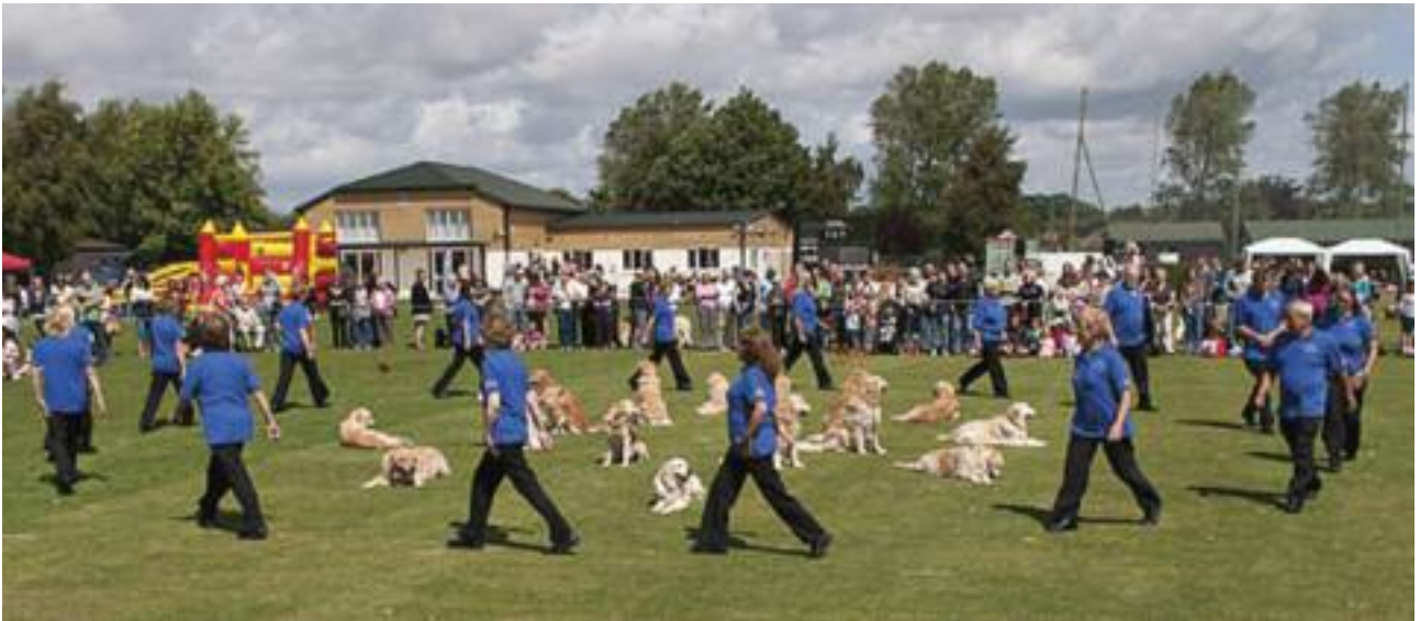
SOUTHERN GOLDEN RETRIEVER DISPLAY TEAM